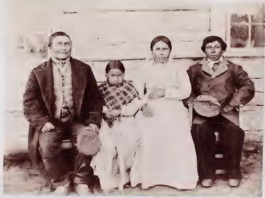
21. Esquimaux Trader and Family, Mumtrokia gamute.